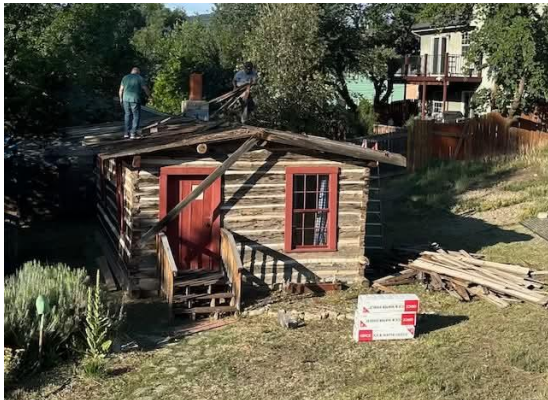
Conservation Before and After: Roof Replacement on the Joy Cabin