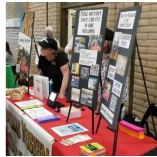
History Trunks and School Outreach