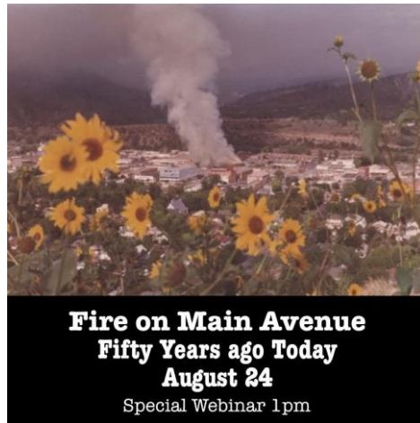
Second Saturday Seminars